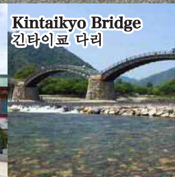
Kintaikyo Bridge 킨타이교 다리