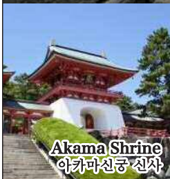
Akama Shrine 아카마신궁 신사