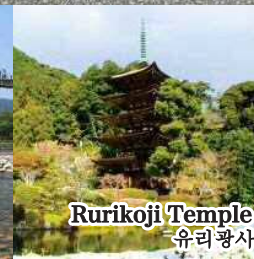
Rurikoji Temple 유리광사