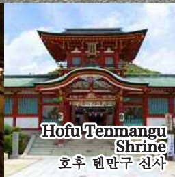
Hofu Tenmangu Shrine 호후 덴만구 신사